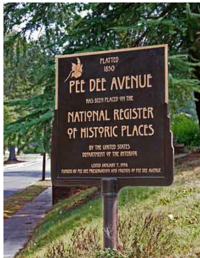
Pee Dee Avenue Neighborhood Marker