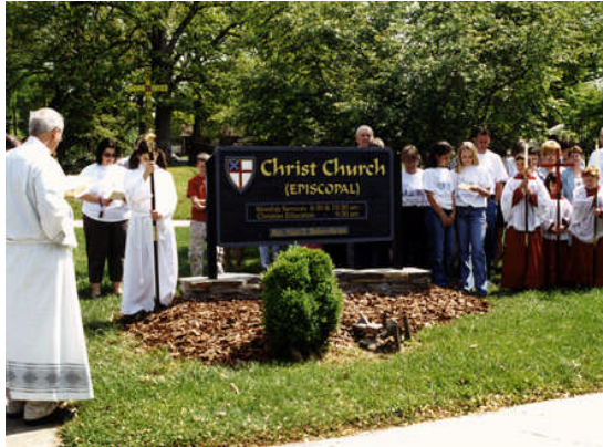
Dedication of the Christ Church sign on Pee Dee Avenue—April 22, 2001

After much discussion and considerable reluctance, the vestry determines and announces in the December newsletter that present-day circumstances dictate that the church can no longer be left unlocked for 24 hours a day, 365 days a year as has been the practice for more than sixty years. Plans are made to have the church open during daylight hours and secured at night.