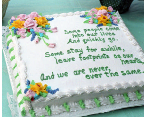
The cake says it all