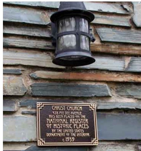
Christ Church Historical Marker