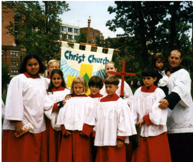
Christ Church Acolytes at National Cathedral

Christ Church enters the electronic age by posting an email address.